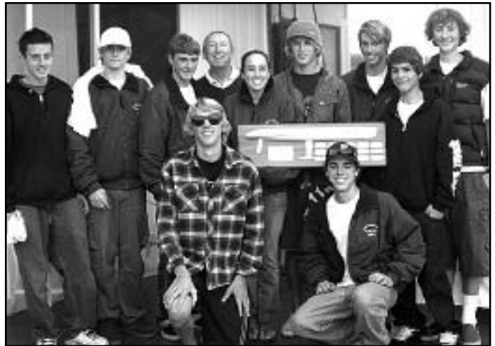
At the Anteater Regatta Roy Disney (center behind back row) presented the Disney Trophy to the Pt. Loma HS team members, honoring their virtual sweep of 2004 PCISA and ISSA championships