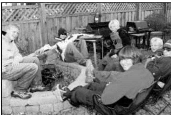
In the Minnesota chill a fire was the place to wait for a breeze at the Cressy regatta