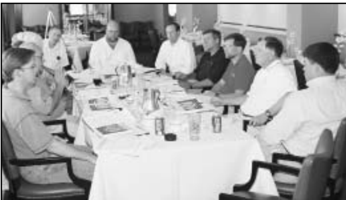
ISSA members at the annual meeting deliberated around a large table

Sailing School • Teen Sailing Trips • Summer Camp • Sailing for Disabled