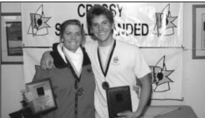
Cressy winners Paige Railey in the Radial Division and Christopher Enger, Full-rig