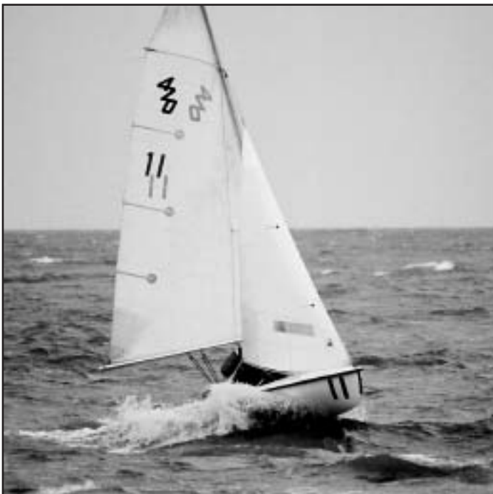
Bumpy water on Lake Pontchartrain at the Great Oaks

All your performance sailing needs online