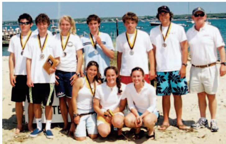
Severn sailors pose for their medal photo. Severn finished 2nd at Baker & 3rd in Mallory

At 1030, running 34 races by 4pm to complete the qualifying round was not possible, so a coaches meeting was called to brief about Plan C. Schools were ranked 1-6 by the results up to race #30 in pre-determined divisions and sail offs were arranged.