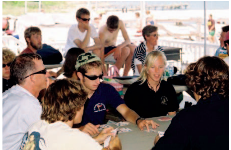
Waiting for the wind.....