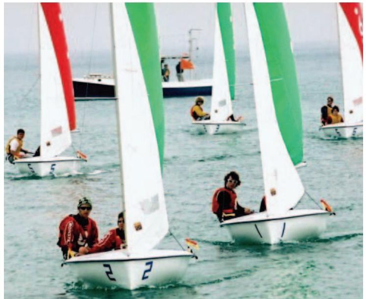
Baker sailors return to the dock for rotation