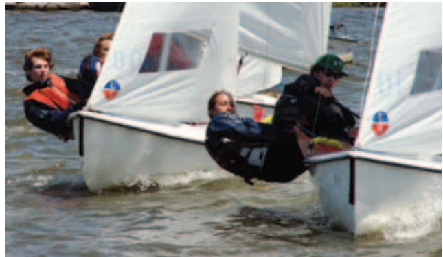
Photos: PCISA Baker Elims held at Sequoia Yacht Club in Redwood City.

Thanks to all participating sailors, schools, coaches, and parents. Special thanks to all race judges, committee volunteers, Peninsula Youth Sailing Foundation, and Sequoia Yacht Club for all of their hard work and kind hospitality. Great racing and good sailing by all.