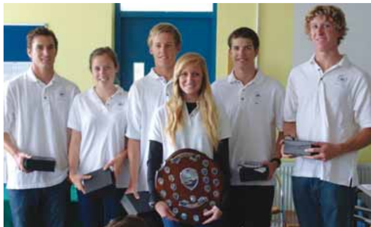
NHHS winning team with the British Schools trophy.

right: NHHS' 6 sailors in a British phone booth.