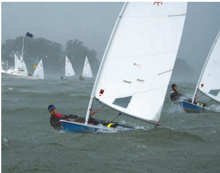
Photo: A wild and wooly Cressy Championship tested the best of HighSchool singlehanded sailors. Photo by ThePhotoBoat.com

VOLUME 16 - ISSUE 1 - Winter/Spring 2007