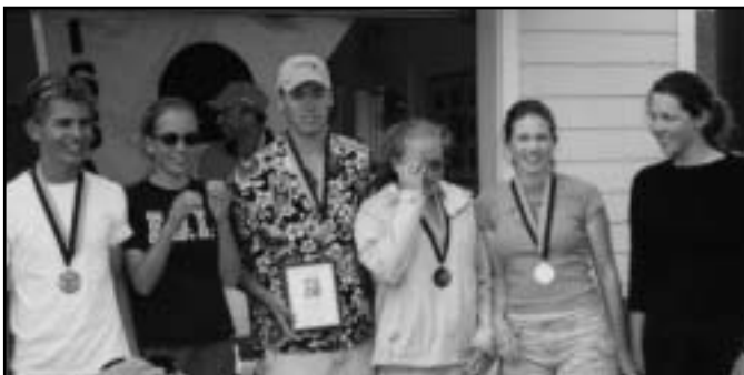
The runner up Bishop's School team at the Mallory regatta