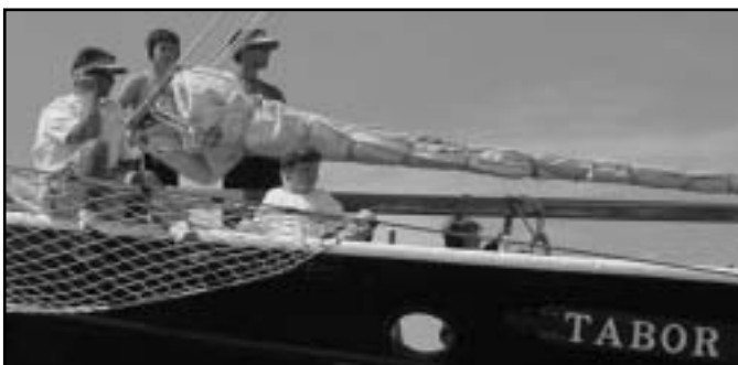
Ideal viewing at the Baker Regatta from aboard 'Tabor Boy'