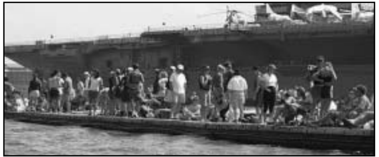
The dock at College of Charleston — with USS Yorktown as a backdrop — was great for watching the action at the Mallory (below).